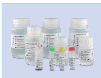
PATHOGENS (DGX) KIT 5 K, 25K