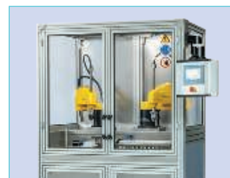
TUBE TRANSFER SYSTEM TTR

○ +31 (0) 85 - 200 7431 ○ info@molgen.com ○ www.molgen.com