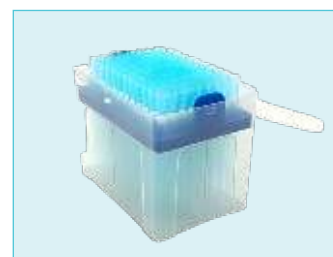
UNIVERSAL FILTER TIPS