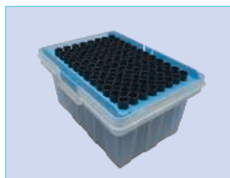
INDUCTIVE FILTER TIPS